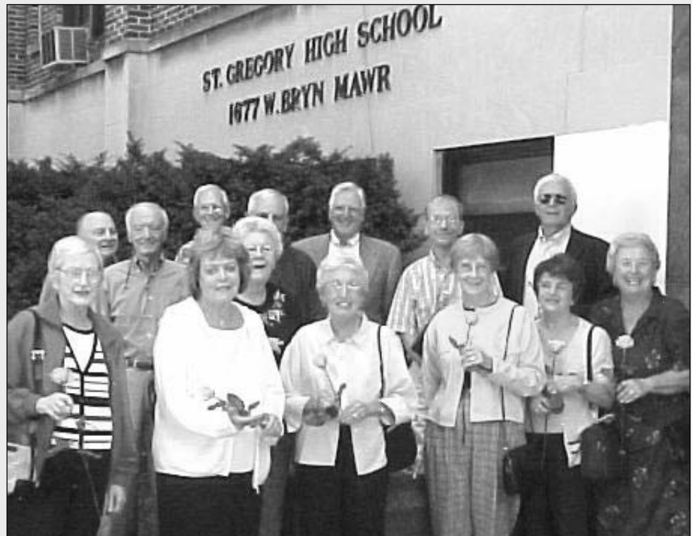
The Class of 1950 returned in September for an "in-house reunion" and lively round-table exchange with the Class of 2006!